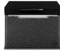
Dell Premier Sleeve - XPS 13